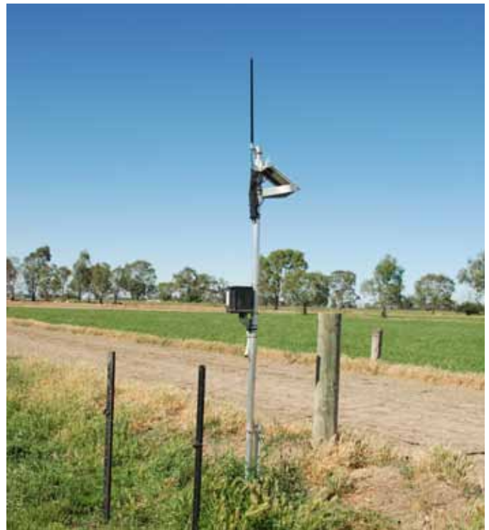
A typical in field soil moisture data logger and telemetry system

There are suppliers that allow products to be rented for a period of time such as the growing season. This may offer an alternative for irrigators that don't want to buy the equipment outright or have short term crops.